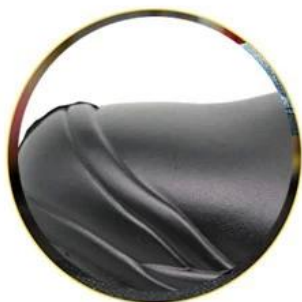
Waterproof leather upper

Removable metatological HI-POLY footbed provides long-lasting underfoot support and comfort.