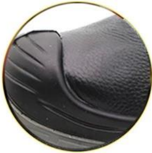
Waterproof genuine leather

Removable metatomical EVA or HI-POLY footbed provides long-lasting underfoot support and comfort.