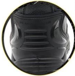
TPU SUPPORT STRUCTURE