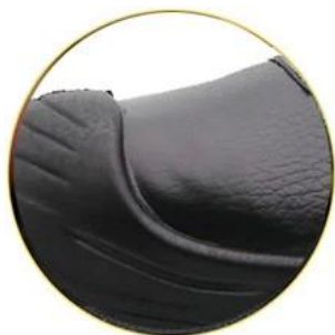
Waterproof cow leather upper

Removable metatomical HI-POLY footbed provides long-lasting underfoot support and comfort.