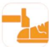
200 JOULE TOE CAP