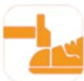
200 JOULE TOECAP