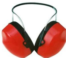
Ear muff/ Plugs