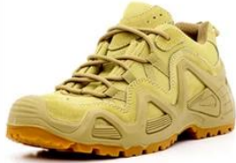
Safety Work Shoes