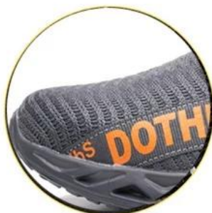
Breathable 3D fly knit fabric