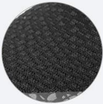
Fly knitting fabric