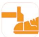
200 JOULE TOECAP