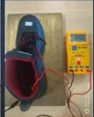
ESD Anti-Static Test