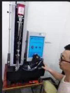
Bondness Test \geq 4.0 N/mm