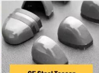
CE Steel Toecap