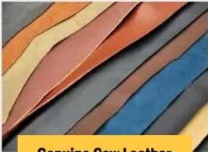
Genuine Cow Leather