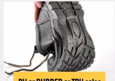
PU or RUBBER or TPU soles