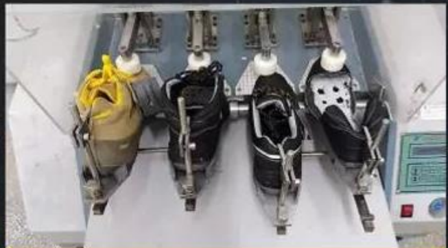
Flex Tester \geq 36,000 T