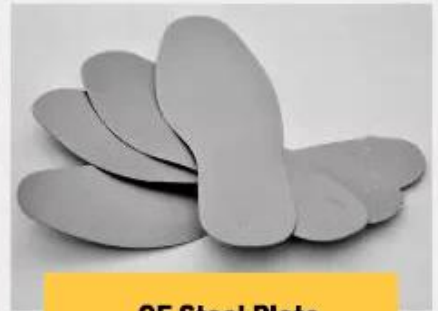
CE Steel Plate