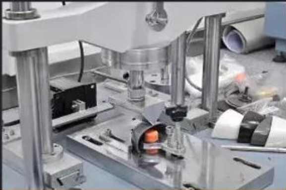
Toecap Test \geq 200 Joules