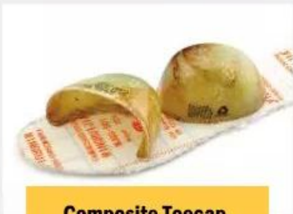
Composite Toe cap