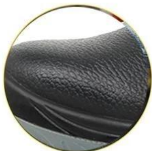
Waterproof leather upper

Removable metatomical EVA footbed provides long-lasting underfoot support and comfort.