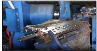
3. PVC Injection