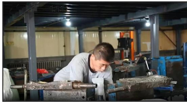
2. Putting Polyester Lining