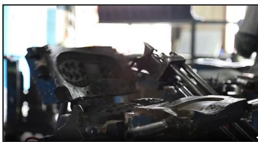
4. Open The Mould