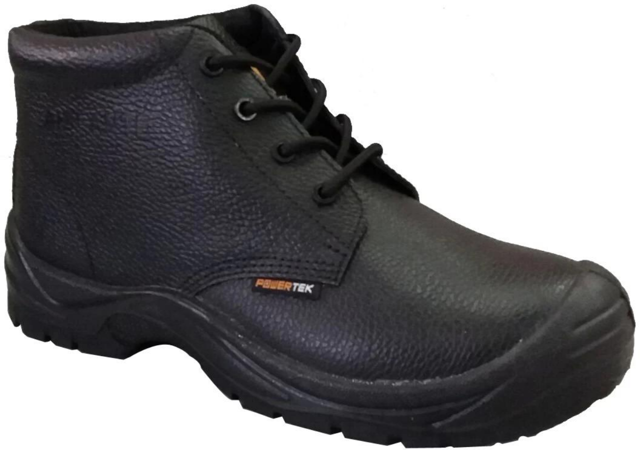
Veiligheidsschoenen enige model show: