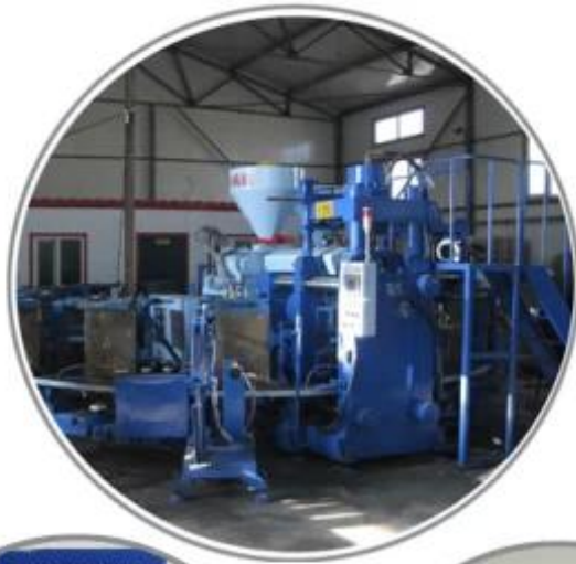
Automatic Injection Molding Machine