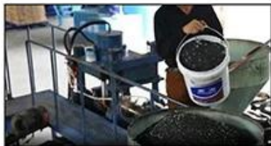
1. Mixing Materials