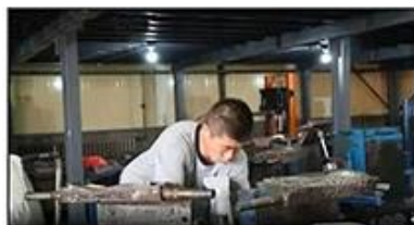
2. Putting Polyester Lining