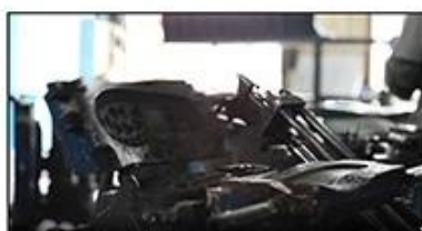
4. Open The Mould