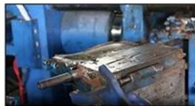
3. PVC Injection