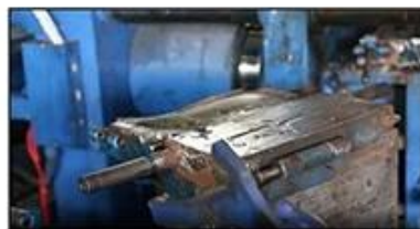
3. PVC Injection