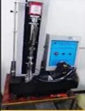
Bondness Test ≥4.0N/mm