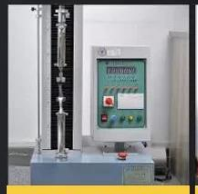
Tear Strength ≥120N