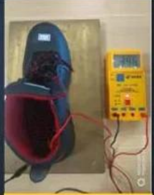
ESD Anti-Static Test