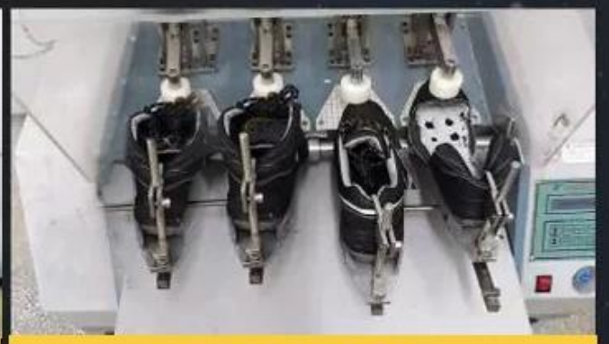
Flex Tester ≥ 36,000T