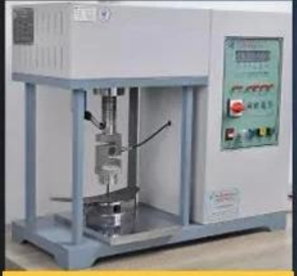
Midsole Test≥1200 Newtons