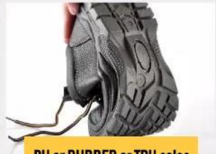
PU or RUBBER or TPU soles