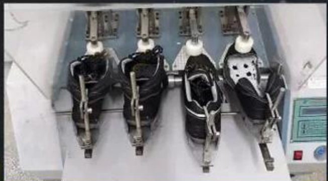
Flex Tester \geq 36,000\text{T}