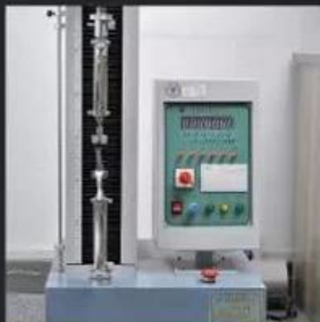
Tear Strength \geq 120\text{N}