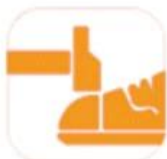
200 JOULE TOECAP