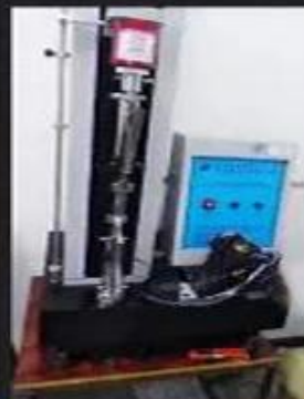
Bondness Test \geq 4.0\text{N/mm}