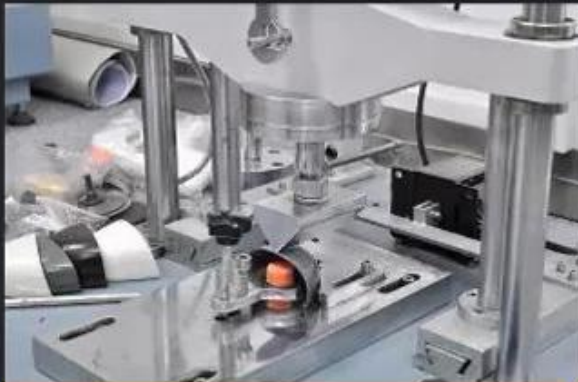
Toecap Test \geq 200 Joules