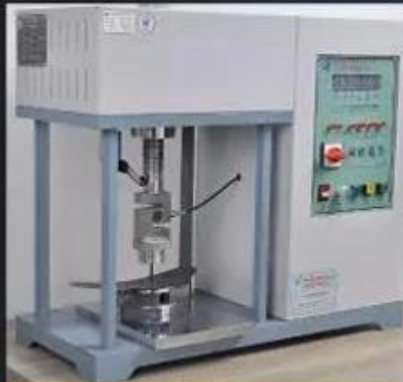
Midsole Test \geq 1200 Newtons