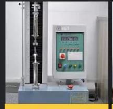
Tear Strength ≥120N