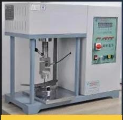
Midsole Test≥1200 Newtons