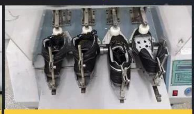
Flex Tester ≥ 36,000T