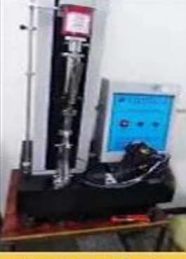
Bondness Test ≥4.0N/mm