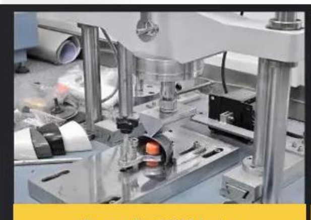
Toecap Test≥200 Joules