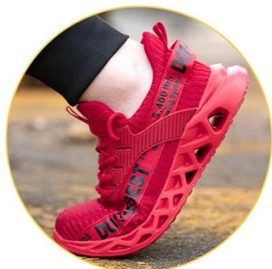
Breathable Mesh Upper

Breathable & Comfortable Uppers Compared with the traditional steel toed leather shoes , the fly weavingshoes are more breath and comfortable , and it will better fit your feet.