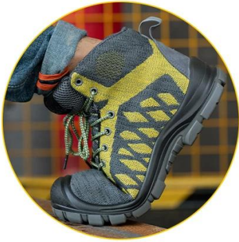
Breathable Mesh Upper