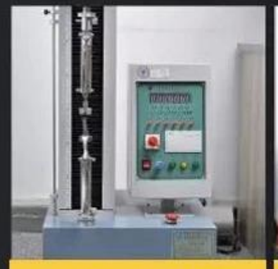
Tear Strength ≥120N