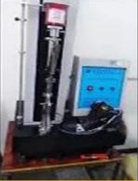
Bondness Test ≥4.0N/mm