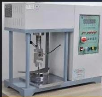
Midsole Test≥1200 Newtons