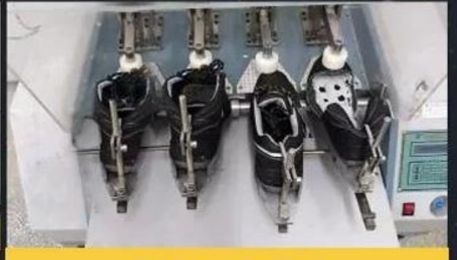
Flex Tester ≥ 36,000T