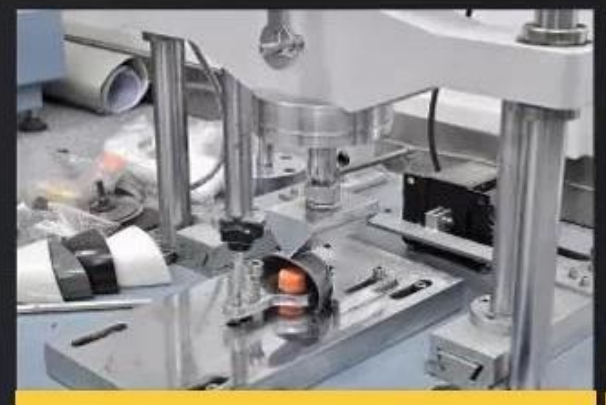
Toecap Test≥200 Joules