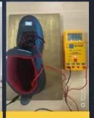
ESD Anti-Static Test