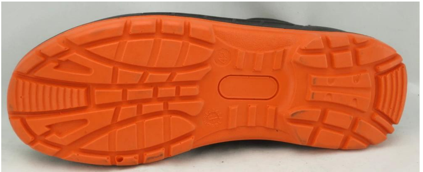
Industrial safety shoes sole model show: