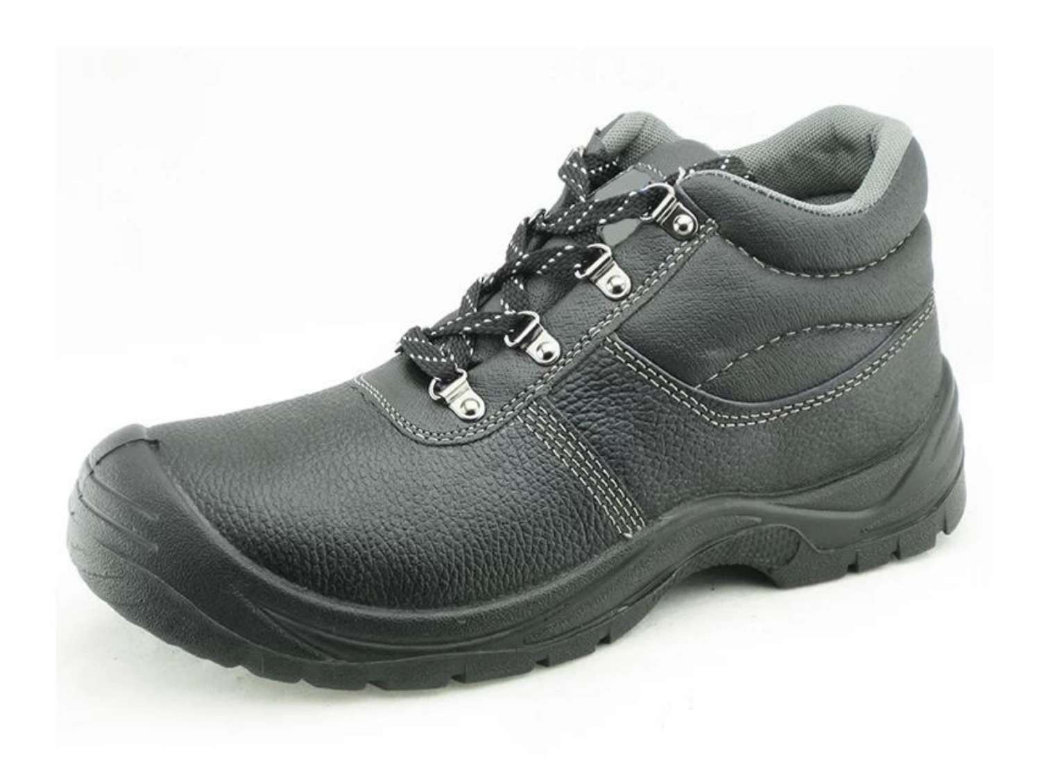
Vaultex brand safety shoes sole show: