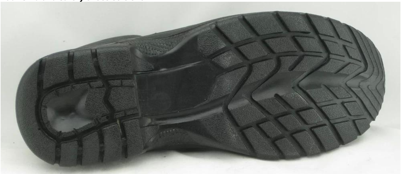
Safety shoes sole model show: