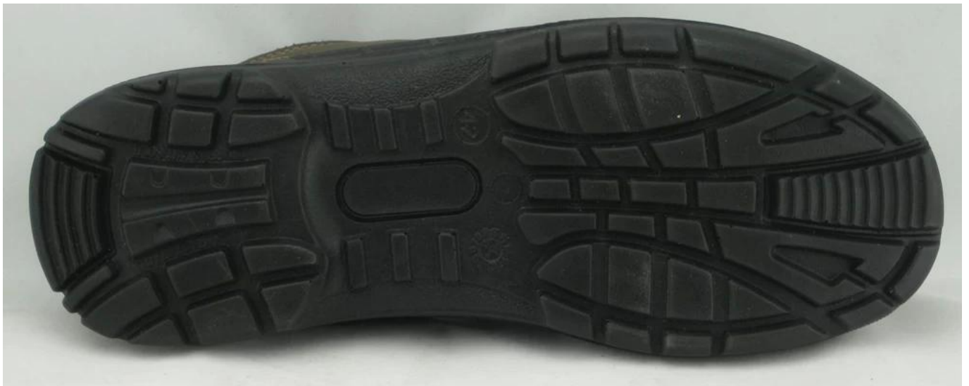
Working shoes sole model show: