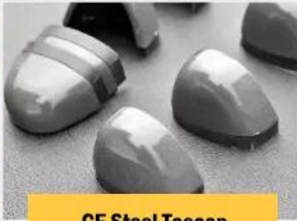
CE Steel Toe cap