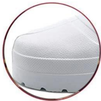
Waterproof EVA upper