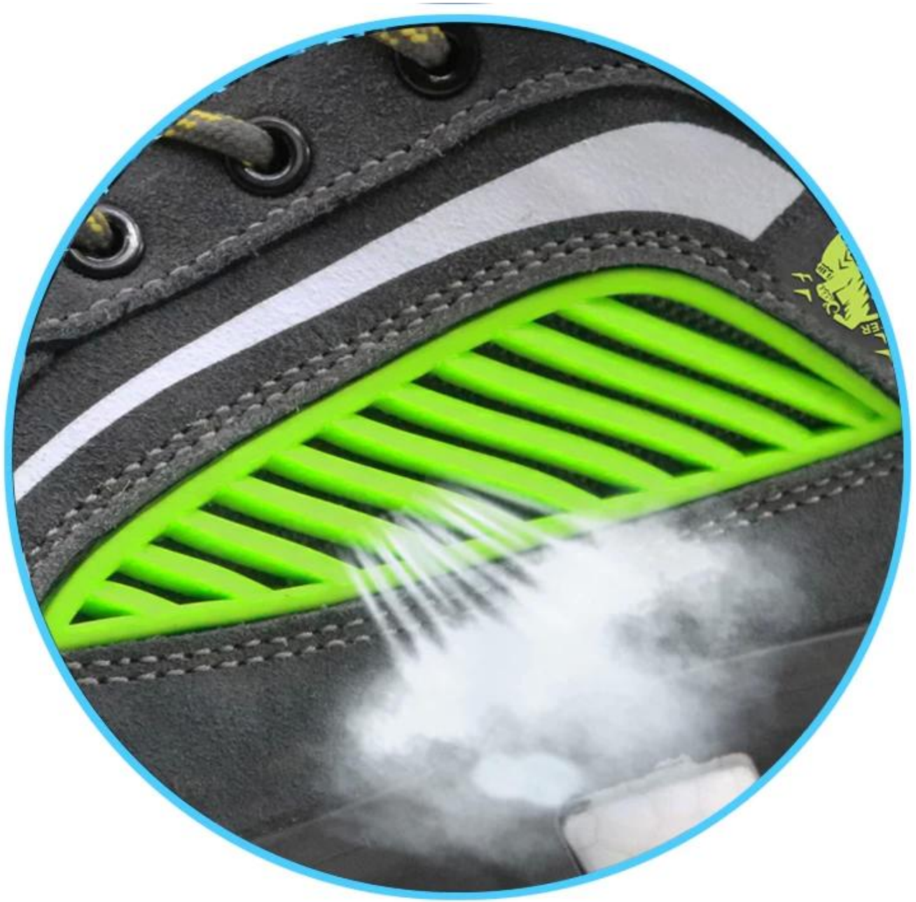
PVC Shark Gills design, Excellent Air Permeability