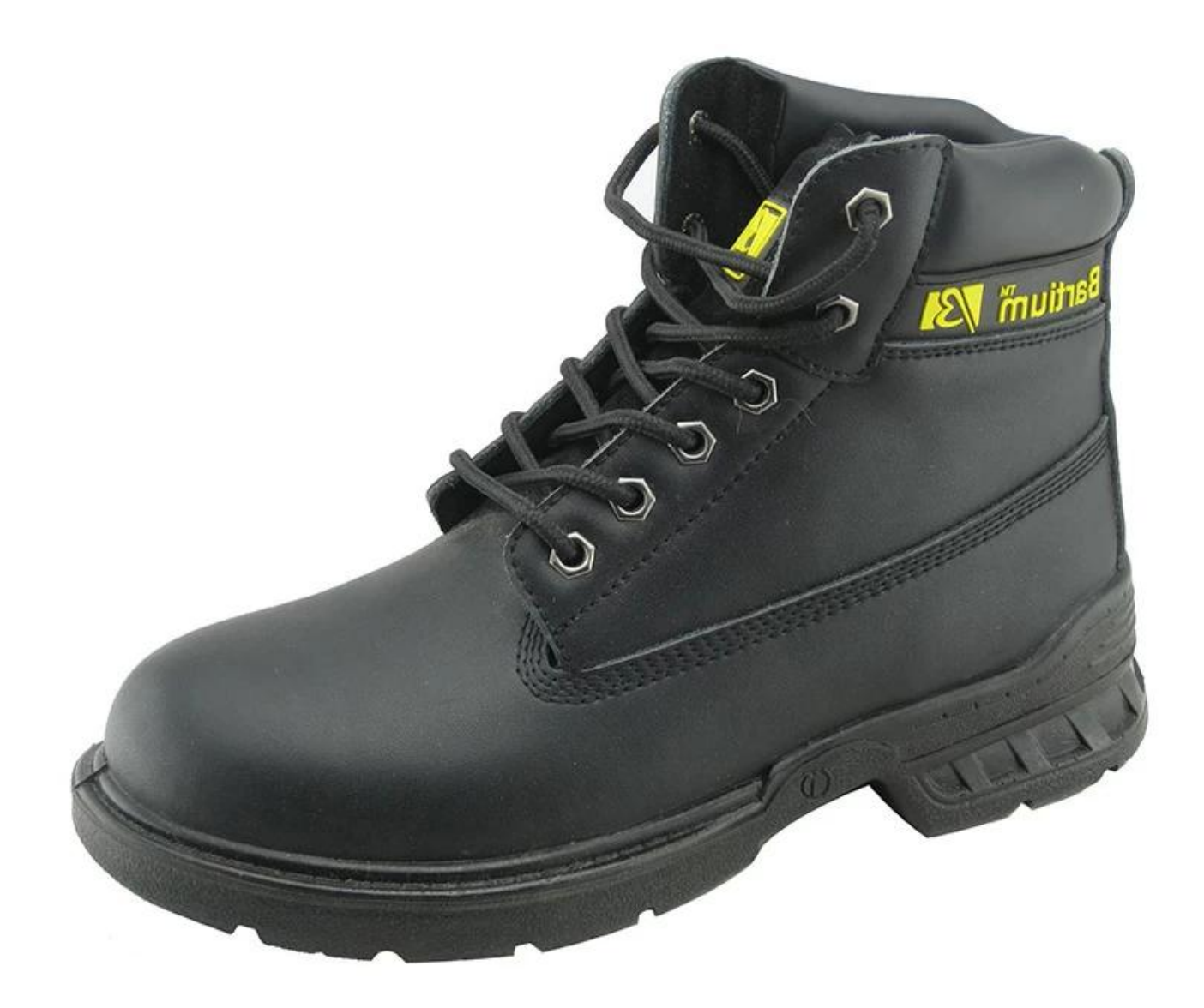
Work Safety boots sole show: