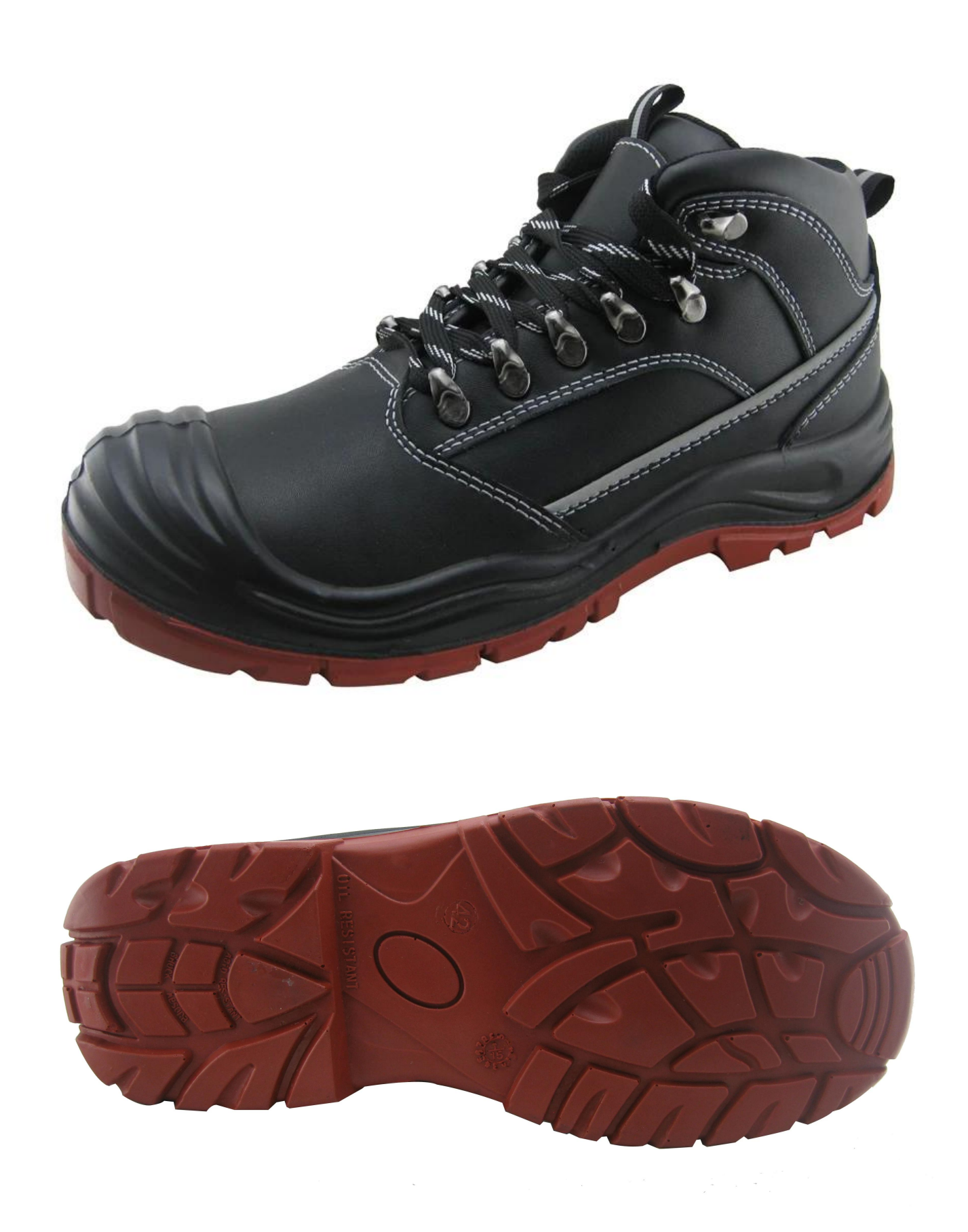
Safety Shoes sole model show: