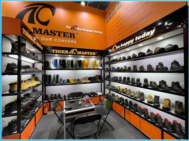
TIGER MASTER® Safety Shoes | Rain Boots