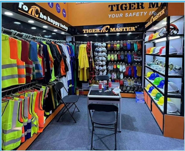
TIGER MASTER® PPE (Personal Protective Equipment)