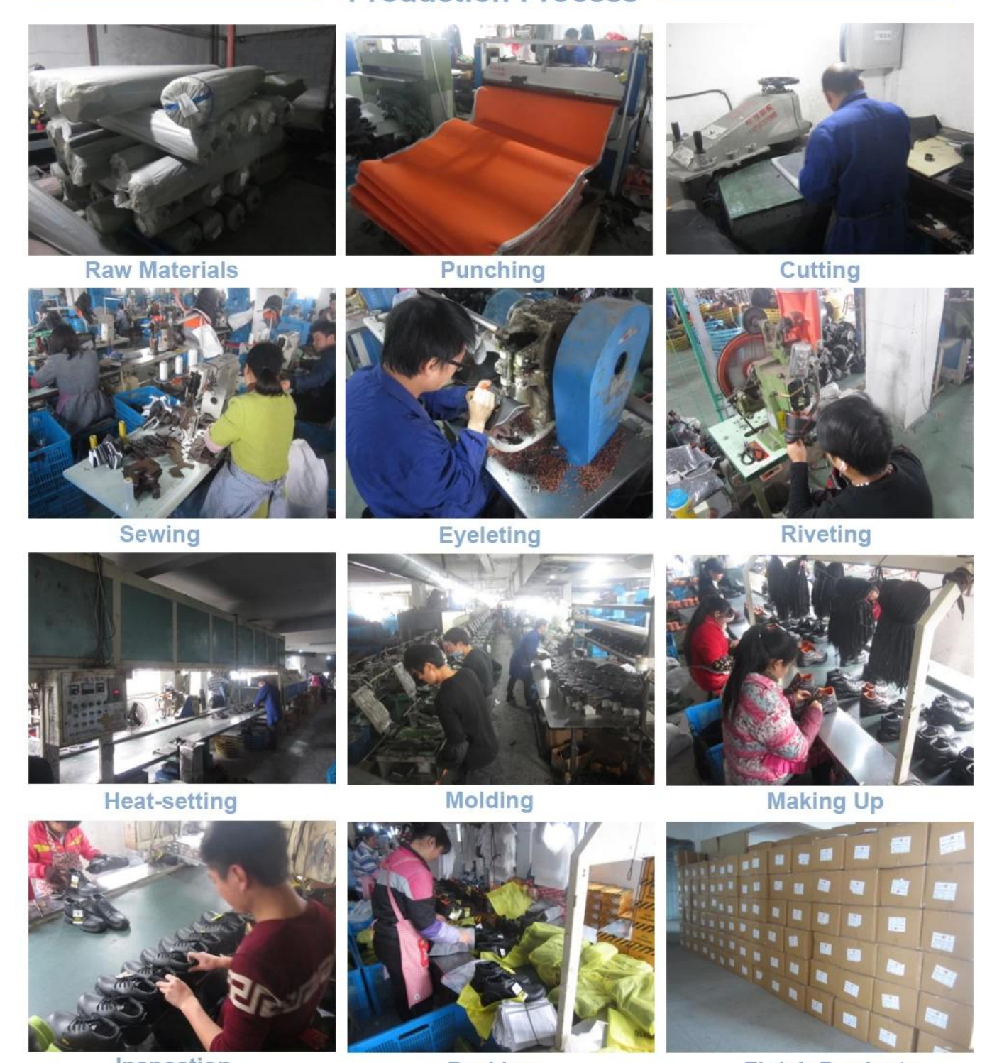
Inspection Packing Finish Products