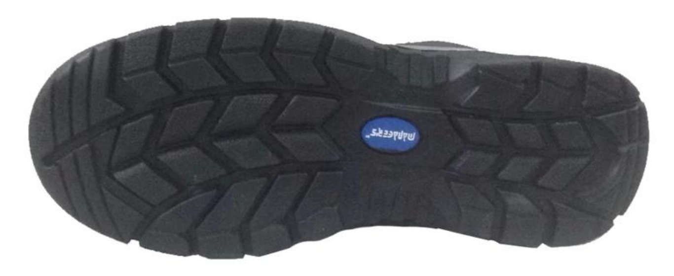
safety shoes sole model show: