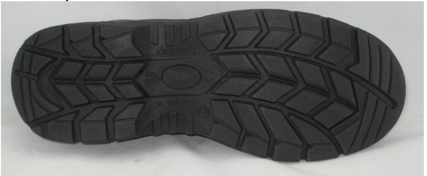
Industrial safety shoes sole model show: