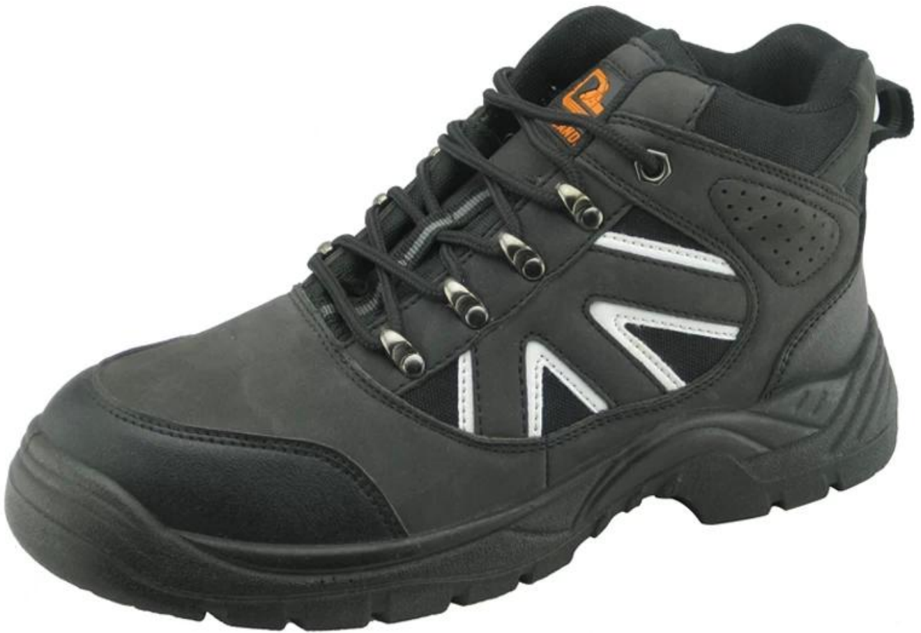
Industrial safety shoes sole show: