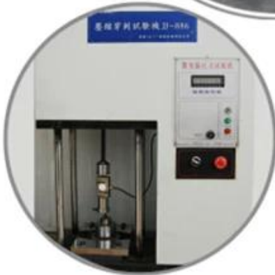
Puncture Testing Machine