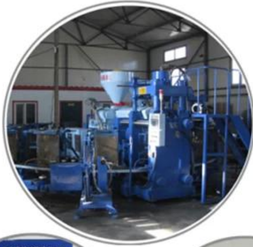
Automatic Injection Molding Machine