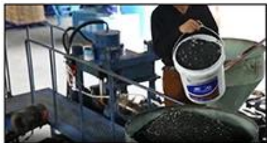
1. Mixing Materials