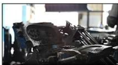
4. Open The Mould