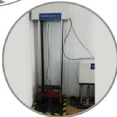
Impact Resistant Testing Machine