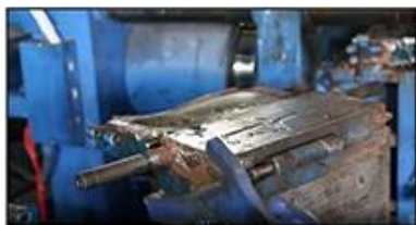
3. PVC Injection