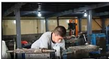
2. Putting Polyester Lining