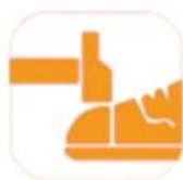
200 JOULE TOECAP