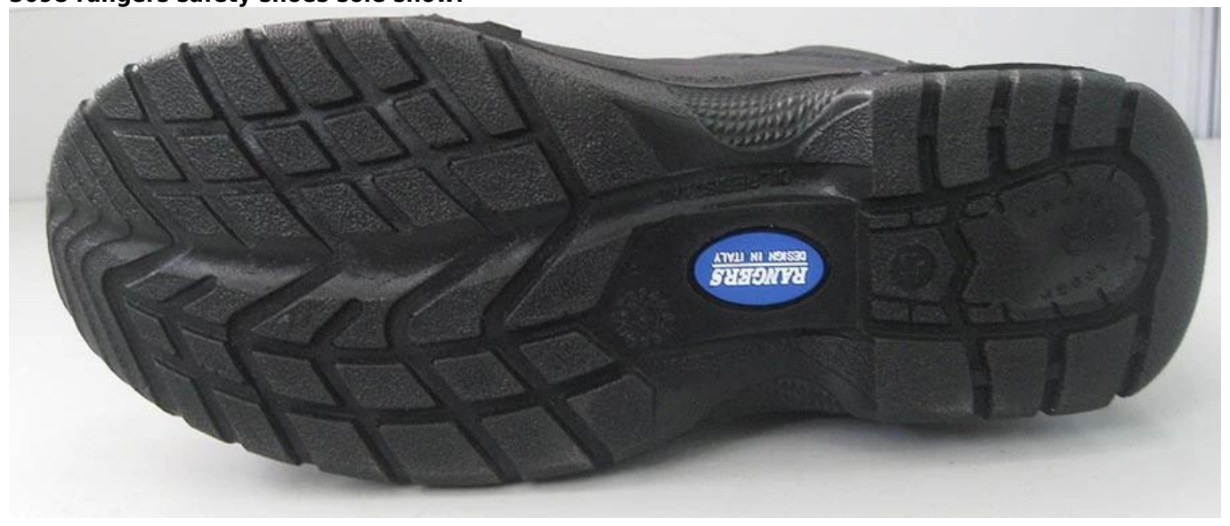
Safety shoes sole model show: