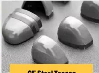
CE Steel Toe cap