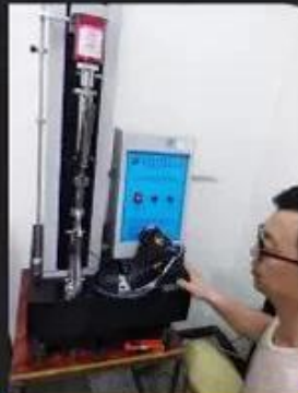
Bondness Test \geq 4.0 N/mm