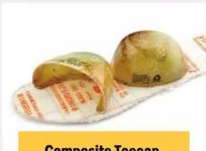
Composite Toe cap