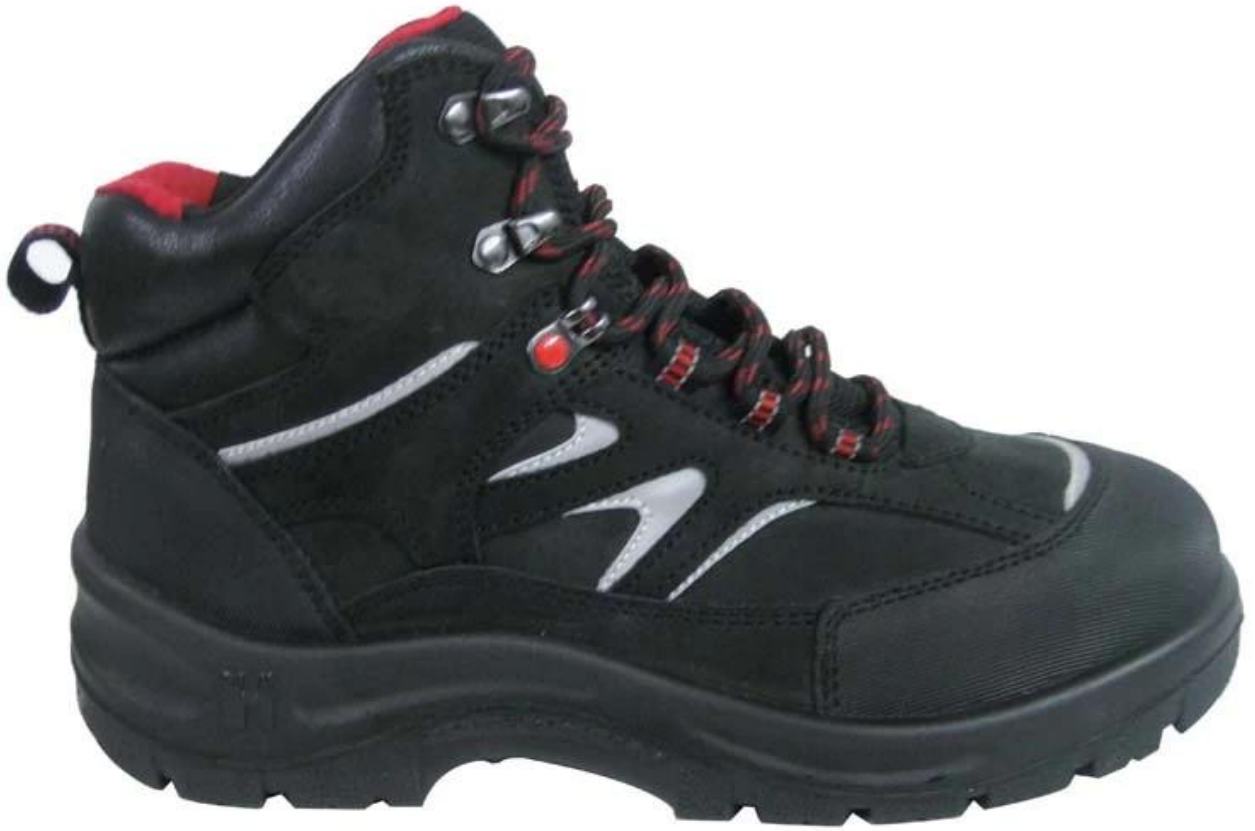
3014 suede leather safety shoes sole show: