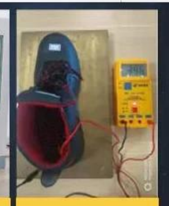
ESD Anti-Static Test