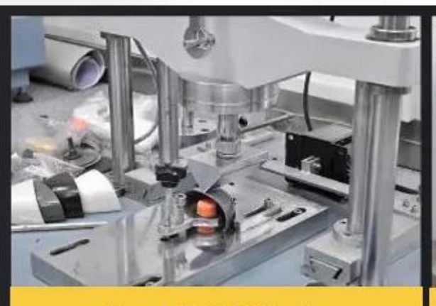
Toecap Test≥200 Joules