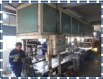
Heat - Setting