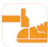
200 JOULE TOECAP