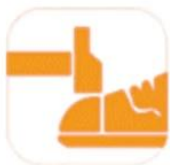
200 JOULE TOECAP