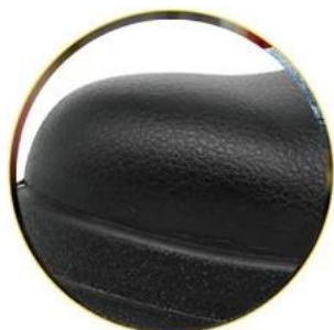
Waterproof leather upper

Removable metatomeal HI-POLY footbed provides long-lasting underfoot support and comfort.