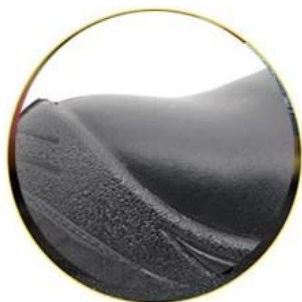
Waterproof leather upper

Removable metatomical EVA footbed provides long-lasting underfoot support and comfort.