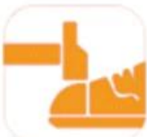
200 JOULE TOECAP