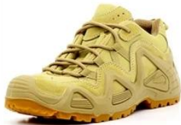
Safety Work Shoes

Link to PPE products website https://china-workwear.com